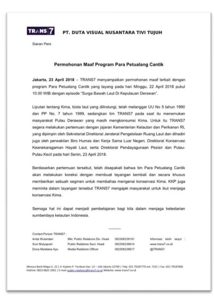
Figure 4. A press release, published by Trans7 to many Indonesian media.

After the public protested the incident, Trans7 requested PROFAUNA Indonesia, as one of the first organizations that raised this issue in a formal procedure, to explain wildlife conservation and the regulations around it. This is to clarify what needs to be improved and which parts are not supporting conservation efforts.