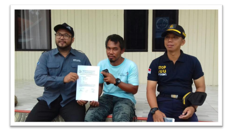
Figure 5. An officer of BPSPL Pontianak and PSDKP Berau Post are showing a statement letter from the tour operator for not exploiting the protected Kima in Derawan, on Thursday, April 26<sup>th</sup>, 2018.

In Indonesia, this kind of tourism and adventure program on television has become one of the trends. However, it is not heavily monitored by the Broadcasting Commission. KPI should begin to open up to see the impact of mass media exposure as a result of viewing protected animals that might not meet the rules of conservation, animal protection, as well as animal welfare.